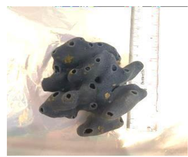
Figure 1 . Sponge from Bakar Island, Central Tapanuli Regency

The sponge sample obtained from the waters of Bakar Island, Central Tapanuli Regency has a purplish blue color and a rough texture which can be seen in Figure 1. The pH of the sea water at the sampling location is 6, the salinity is 36 ppt and the temperature is 27°C. The position of the sample collection location based on GPS data is N.1.35.17.N.98.41.56.E. Measurement of the environmental conditions of the sea water at the location Sampling aims to create suitable environmental conditions for testing symbiont bacteria so that the symbiont bacteria can survive.