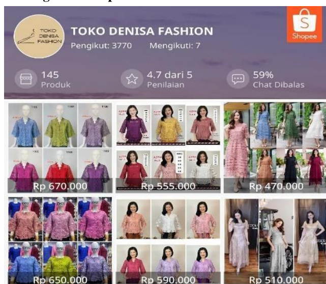
Figure 2. Shopee Account Denisa Fashion Store

and online sales. Denisa Fashion uses e-commerce Shopee to market and sell its products online with the shop name "TOKO DENISA FASHION". Toko Denisa Fashion has joined Shopee since 2020 with followers of 3770, and a rating of 4.7 (1.3 thousand ratings). This shop is a shop with the "Star" label, and sells 145 products in it. Based on reviews from customers, most of them gave it 5 stars.