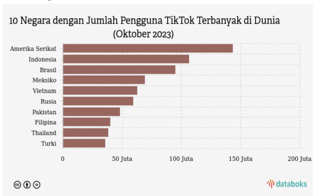
Figure 1. The number of TikTok users in the world as of Oct. 2023

TikTok is currently one of the most widely used social media that is most widely used by the public. This a great opportunity for businesses to business people to market their products through TikTok. According to a report from Katadata.co.id that We Are Social and Hootsuite reported that as of January 2023, users of this short video application globally reached 1.05 billion (Annur, 2023). Based on the country, the majority of use of TikTok in the world is in the United States with 113.25 million users. Then followed by Indonesia with 109.0 million users which makes Indonesia ranked second. So marketing through social media platforms social media platform Tiktok is very promising for business people in Indonesia.