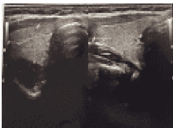
Figure 2 Neck ultrasonography results showed giant cyst lesion on parathyroid glands.

On Neck ultrasonography results showed giant cyst lesion on parathyroid glands, normal size thyroid, homogeneous parenchymal echogenic without focal lesions and without lymph enlargement (fig. 2). On Head CT Scan examination found suspect metastatic bone (fig. 3),