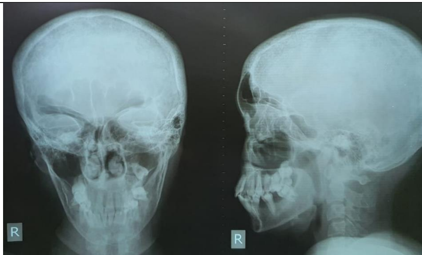
Figure 3 On Head CT Scan examination found suspect metastatic bone

On Body bone scans found pathological picture of bone metastatic process (fig. 4), X-ray pelvic found bone metastasis disease (fig. 5). On Lower Limb X-ray found lump of tibia. (Figure 6)