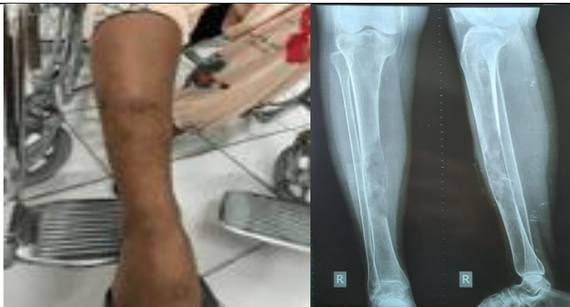
Figure 6 Lower Limb X-ray found lump of tibia

Patient then diagnosed with Brown tumor in right lower limb caused by primary HPT and planned for surgery management.