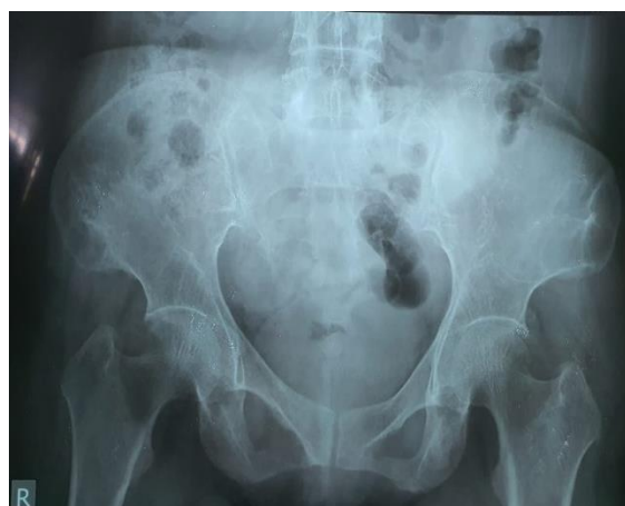
Figure 5 X-ray pelvic found bone metastasis disease