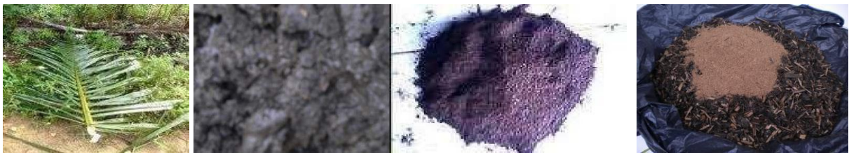
Figure 1. Substrate based on oil palm plantation and industrial waste (palm leaf, palm sludge and palm kernel cake)

The tools used are autoclaves, incubators, pH meters, Erlenmeyer, spectrophotometers, stirrers, test tubes, micropipets, penagas, centrifuge, filter paper, gauze, 1 kg plastic, incase.