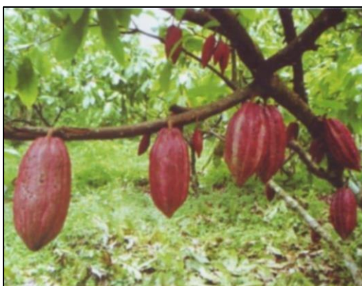
Figure 1. Cacao tree and fruit

rural area is feasible as there is enormous biomass for biogas input. Cacao pod for example, could be used to improve modern energy ratio in rural area.