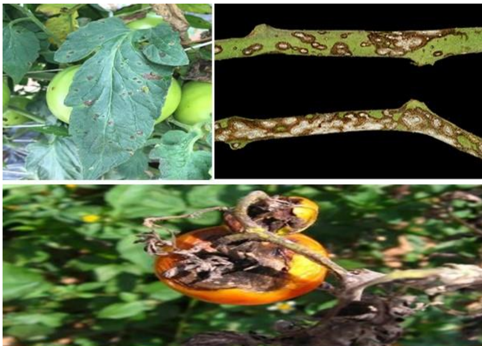
Figure 1: Symptoms of tomato early blight disease caused by Alternaria spp.

Various symptoms were observed in the field during sampling (Fig. 1). These include spots of light-brown to dark brown, roundish-oval to irregular spots of 2 mm diameter in the early stage on foliar parts. This expanded when the infection reached an advanced stage. Black spots on the fruits with concentric rings were also observed.