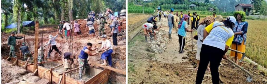
Figure 1. Marharoan Bolon tradition, Simalungun

environment. Modernization, urbanization, and changes in social structure pose serious challenges to the continuity of this tradition. The shift to individualistic mindsets and the weakening of community ties threaten the existence of the collective values that form the foundation of Marharoan Bolon. Therefore, it is important to reexamine the strategic role of this tradition in the context of sustainable development. Through an ecological sociology perspective, an analysis of Marharoan Bolon can reveal how local traditions contribute to environmental sustainability while strengthening the social resilience of communities.