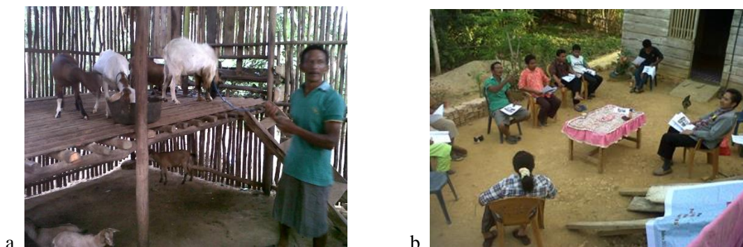
Figure 1. (a) The condition of goat farms on the coast of Kendari City; (b) Discussion with goat farmers.

At the beginning of the activity, the community service implementation team made initial preparations by way of an initial survey of livestock groups to identify problems related to the goat farming business around the Anduonohu Market, Kendari City.