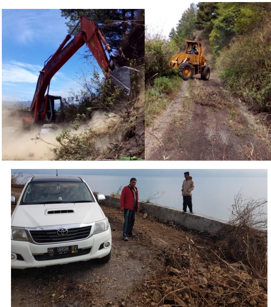
Figure 3. The process of repairing the landslide roads and opening the road access (top); supervision and test for 4-wheel vehicles (bottom)