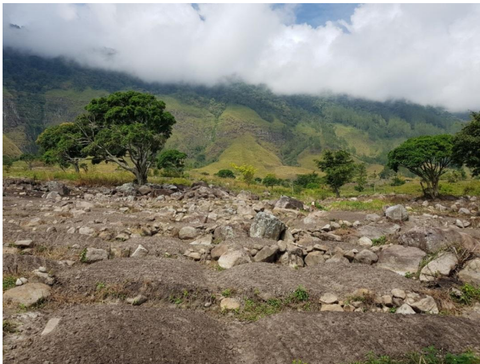
Figure 7. The planting field for the cultivation of the red onion plants

In accordance with this activity, the most important thing was preparing the planting field. The field used to cultivate onions should be prepared before the seeds arrived in the region. Thus, the field was cleaned and was raised up to 30 cm to avoid tubers submerged in water during the growth period which could cause the decay of the tubers (Figure 7). After the seeds arrived at the planting field, the seeds were directly planted on the agricultural field by the local community. The process of planting the seeds was performed in accordance with the right procedure of onion cultivation for a maximum production. Therefore, the local community were trained first in terms of cultivation and maintenance of red onions. To date, the red onion plants of the local community which are one month old grow well. It is expected that these onions would produce optimally, so it can improve the economy of the local community.