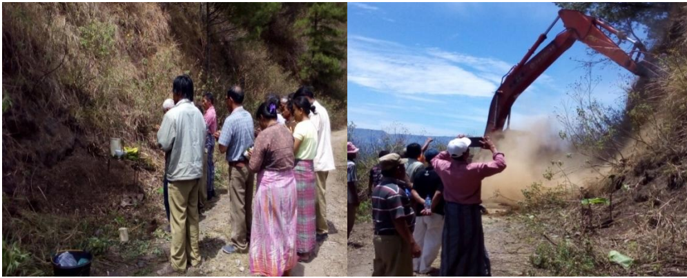
Figure 2. The ritual ceremony performed by the local community