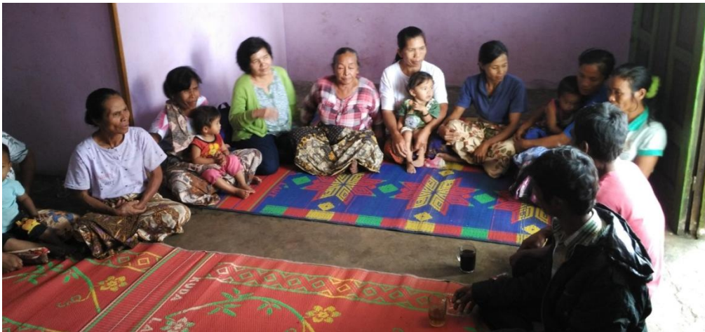
Figure 5. Socialization and training with the local community about red onion plants

The activities conducted was socialization and training about red onion cultivation (Figure 5). Further, activities were continued with planting. As dry season in this region would last until August this year, climate should be a special concern to increase the success rate of growing. According to the plan and considering the high public interest to cultivate this commodity, 1000 kg red onion seeds were provided by the team. These seeds were distributed evenly to all village farmers in accordance with the results of community meetings.