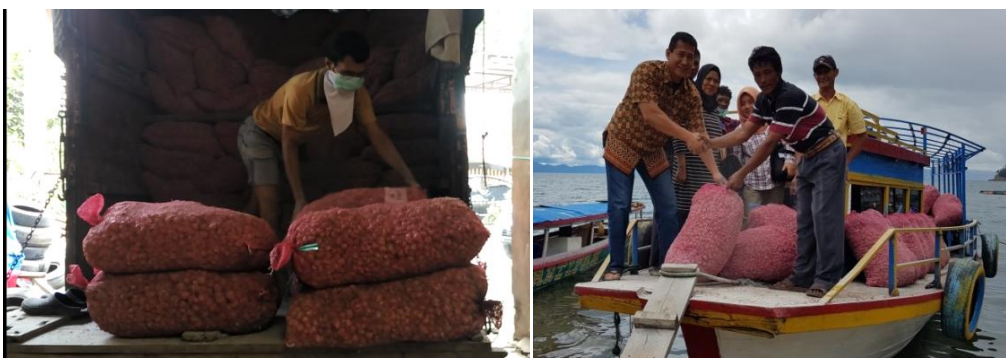
Figure 6. The process of transporting high quality red onion seeds using truck and boat

To accelerate the process of transportation, the introduction of red onion seeds was conducted without waiting for the roadwork was completed. Therefore, the process of transporting the seeds was done using 125 HD diesel colt type of truck and followed by water transportation namely boat (Figure 6).