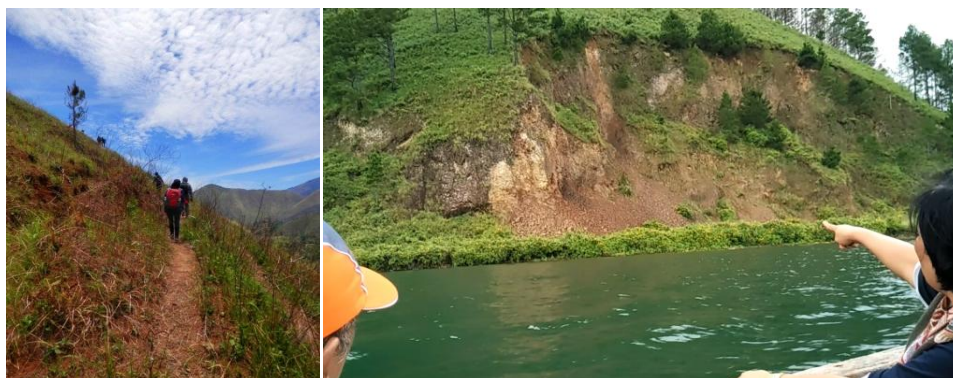
Figure 1. The footpaths to be built (left); One of the landslide roads which would be opened, seen from a boat (right)

Until the time that this report was made, the process of opening the road access is still in progress and has been completed 50%. The road access which has been opened and can be passed by 2-wheel vehicles and 4-wheel vehicles is about 4 km. This activity has lasted for 1 month using heavy equipments, such as a bulldozer and a wheel loader (Figure 3). The process of opening and improving the road access was expected to finish in the middle of September 2017. The most difficult and time-consuming work in this activity was cleaning the road which was struck by a landslide at 3 points along 1 km. However, this road has been improved and it can be passed by vehicles nowadays (Figure 4).