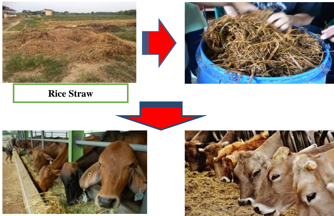
Figure 2. The Process of processing rice straw into SIPROMO rice Straw

The schematic diagram of rice straw Sipromo technology shown in Figure 2.