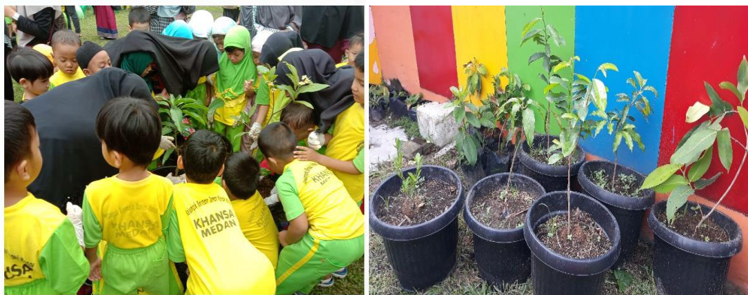
Figure 4. Planting fruits by children of Khansa Kindergarten

Environmental education activities in Khansa Kindergarten can be seen in Figure 4 and Figure 5. Students were very happy and eagerly to get involved in planting activity. By learning benefits of each plants, children understand the benefit of the planting activity and humans'role in protecting the environment. This method was done to make students aware of their duties and responsibilities, namely protecting nature and the environment, installing to students that every living thing including plants has a function for the environment. This method can also teach kindergartners to love nature with simple things.