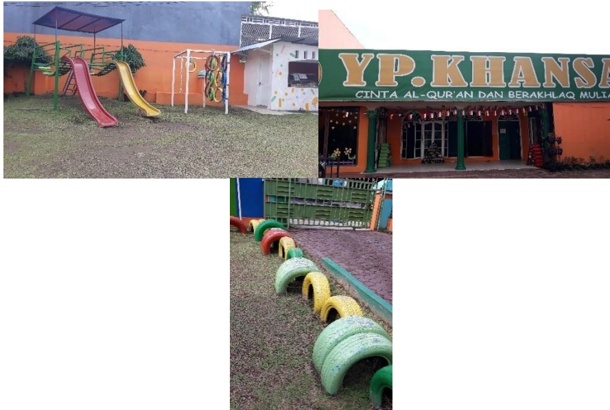
Figure 1. The situation of Khansa Kindergarten before community service activities

only about 20% of vegetation in Khansa Kindergarten. In the front yard of the Khansa kindergarten there is Polyalthia longifolia (Figure 1) and in the backyard, there is a Syzygium aqueum tree. There is still a lot of room in the front and back yards that can still be planted with various types of plants. therefore, community service activities at this school need to be carried out.