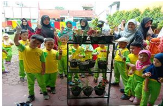
Figure 5. The reaction of Khansa Kindergarten children after planting

In addition, children were also taught to manage waste by making potted plants from used bottles. They also harvest the vegetables and cook them at school and learn to like vegetables [11][12][13][14].