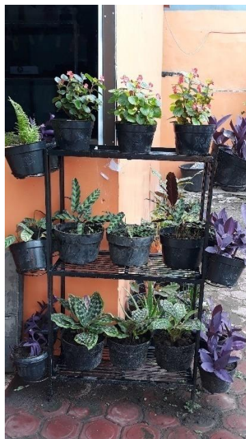
Figure 8. Arrangement of flowers produced by Khansa Kindergarten children