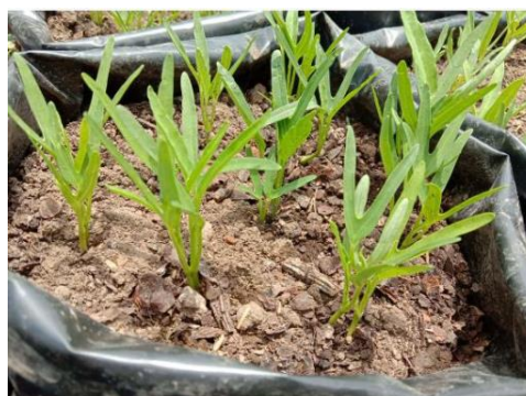
Figure 6. Spinach ( Amaranthus spinosus ) age 1 week with 6.5 cm height

The results of vegetable growing activities in Khansa Kindergarten can be seen in Figure 6. Figure 6 shows that at the age of 3 days planted spinach has reached a height of 1.5 cm. after the age of 1 week increased by 5 cm to 6.5 cm. Khansa Kindergarten children were very happy to observe the growth of their plants, since the process of the plants began to grow to form leaves. By observing the plants growth on daily base, the students started love their environment.