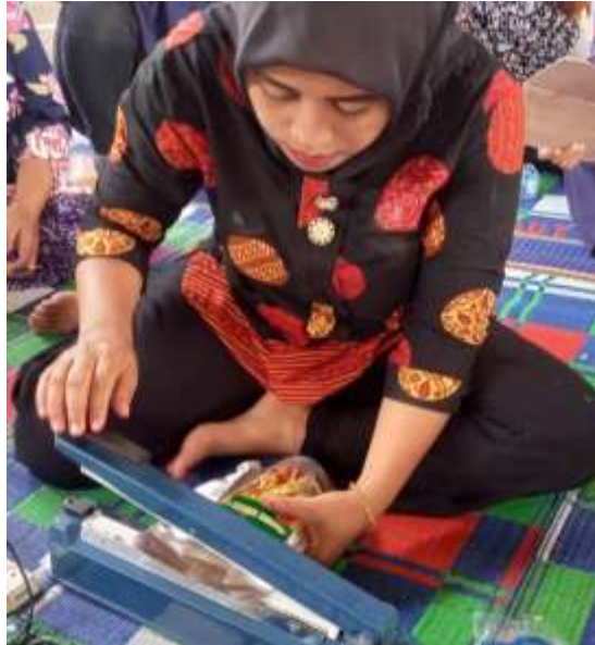
Figure 2. Demonstrating Packaging

The next process is the packing of oyster mushroom chips where the newly-pressed oyster mushroom chips from the Spinner are cooled briefly afterward inserted into the labeled packaging that has been prepared and the using the Handsealer so that the oyster mushroom chips are durable/not easy to get into the wind (Figure 2).