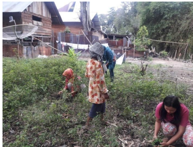
Figure 5. Growing moringa plant was planted in field

Moringa plants were brought to field. The community were taught how to make a hole, i.e, the soil was perforated 10 cm first and the soil was placed separately because the soil was top soil. The hole was continued dig 10 cm and then the plant was inserted by cutting the polybag first and then covered by the top soil (Figure 5). All the time of planting, plant should not have too much shaking. Next, it was given shade by using leaves on the right and left.