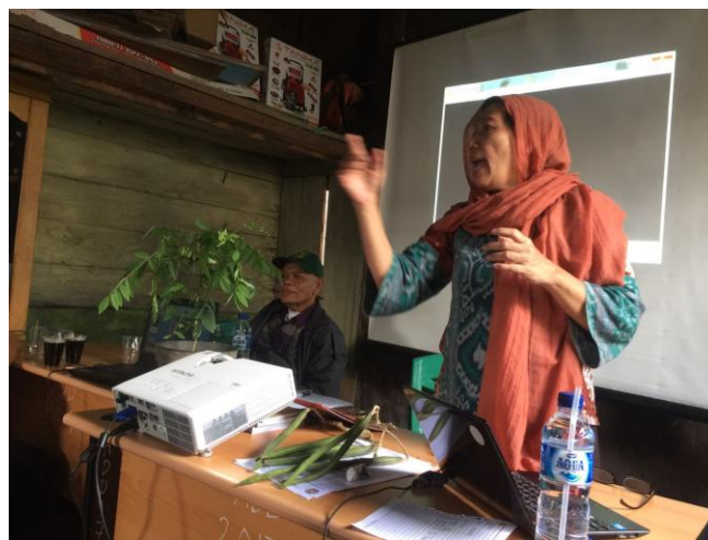
Figure 3. Training of Moringa as multi purposes plant