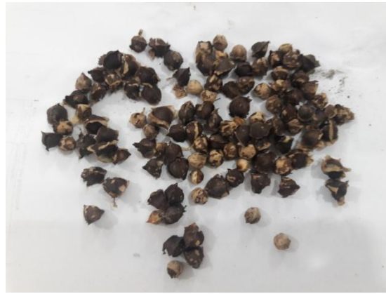
Figure 2. Moringa seed