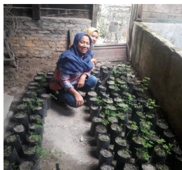
Figure 4. Moringa seed maintenance

Seed maintenance was conducted by cleaning polybags from weeds and watering (Figure 4). Watering was done every three days because the seedlings should not be too moist. Maintenance was carried out by the Lumban farmer group. Besides that, the seed was protected by paranet around so that it was not disturbed by livestock such as chicken and samosir goats. Seed than grew into sprout and then into Moringa plant.