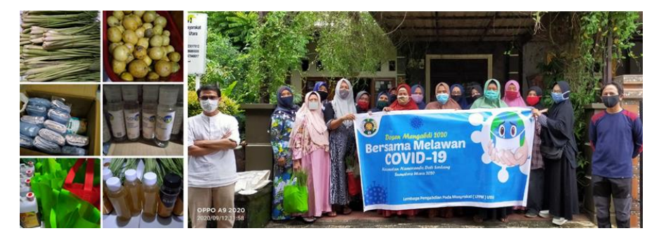
Figure 2. Health drink ingredients and training participants