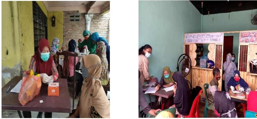
Figure 4. Counseling and education related to health problems in the elderly people