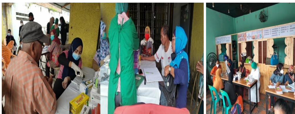
Figure 3. Health examination for the elderly people

Based on Body mass index (BMI), 47.76% of elderly people with obese, and 19.40% with overweight. Based on blood pressure, as many as 40.30% with systolic hypertension and 22.38% with systolic prehypertension; as much as 28.36% with diastolic hypertension, and 23.88% with diastolic prehypertension. Based on blood glucose levels, as much as 20.90% of elderly people with high blood glucose levels. Based on blood cholesterol, as much as 32.84% of elderly people with high cholesterol.