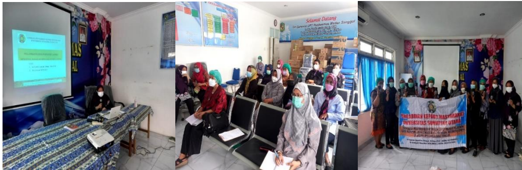
Figure 1. Training for elderly posyandu cadres on health problems in the elderly and the implementation of 5 tables at the elderly posyandu

as well as the role of cadres in motivating the elderly and the performance of cadres in implementing the posyandu for the elderly..