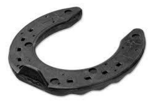
Figure 1 Steel-made horseshoe [2]

Horseshoe is functioned to protect horse's hooves against blows and extreme wear caused by contact with the ground [1]. Horseshoes are usually made of iron/steel with the size suitable to place underneath the horse's nail/hooves [2]. A typical steel-made horseshoes is shown in Figure 1. The use of conventional horseshoe may deteriorate the hooves caused by nails which is in practice directly nailed to the hooves. Thus horseshoes made of alternative materials such as plastic and suitable for horse racing [3] and polymeric composites have been developed [4] [5] [6].