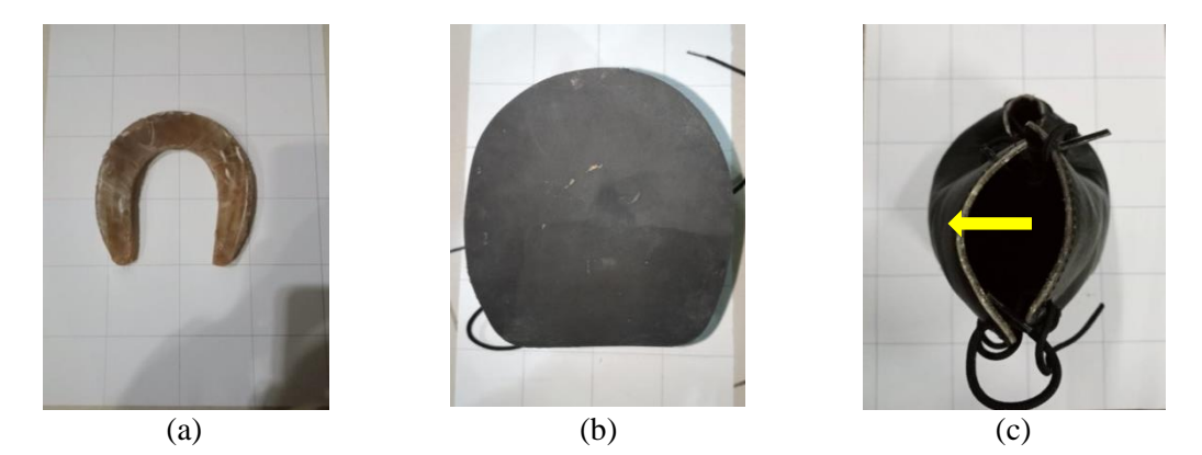
Figure 3 (a) Horseshoe (b) Horseshoe boots' sole (c) Horseshoe pad inside the boots

In our previous researches we have reported that polymer reinforced by fiberglass horseshoe can be used as an alternative to steel-based horseshoes [3,4]. The horseshoes were made by hand layup method with BTQN 157 EX resin reinforced with fiberglass. MEKPO catalyst was used to accelerate the formation of the structure. The horseshoe that is formed are then wrapped in a cowhide boots/cover with rubber pad and soles, the shoelaces used are wool materialled, as generally used on humans. Pictures of horseshoe and boot's footwear can be seen in Figure 3.