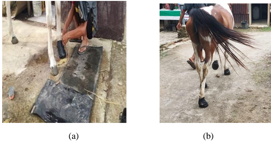
Figure 4 (a) Applying Horseshoe (b) Horse's walking movement

Unfortunately, gallops test result is not available due to the limitations of the field and the health of the horse. Therefore, the horseshoe test was discontinued until the horse's movement was amble/canter. The picture of applying horseshoe and the horse while performing a walking movement can be seen in Figure 4.