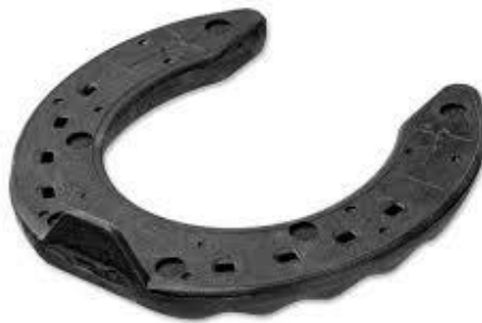
Figure 1 Steel-made horseshoe [2]

Horseshoe is functioned to protect horse's hooves against blows and extreme wear caused by contact with the ground [1]. Horseshoes are usually made of iron/steel with the size suitable to place underneath the horse's nail/hooves [2]. A typical steel-made horseshoes is shown in Figure 1. The use of conventional horseshoe may deteriorate the hooves caused by nails which is in practice directly nailed to the hooves. Thus horseshoes made of alternative materials such as plastic and suitable for horse racing [3] and polymeric composites have been developed [4] [5] [6].