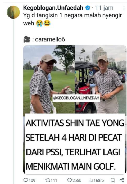
Picture 3, News Report of Kegoblokan.Unfaedah on X

The news contained a video showing Shin Taeyong still smiling and playing golf casually, even though he had just been dismissed as the coach of the Indonesian national football team recently and had sparked controversy among local football fans.