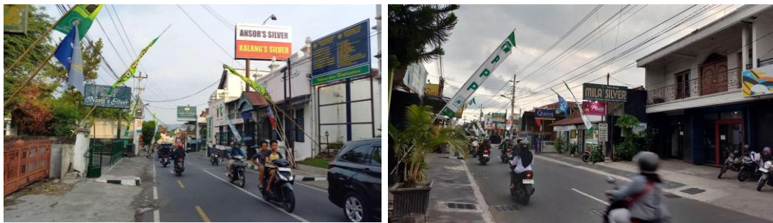
Image 2. Suasana Jl. Mondorakan (left) dan Jl. Kemasan (right), Kotagede