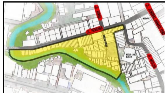
Figure 1. Project Location

Project location of Rejuvenating the face of Medan is at Perdana Street dan Pasar Hindu, Kelurahan Kesawan, Kecamatan Barat, Medan. This area limits are reaching the Deli River. The site function as commercials, residential, and public areas. The areas that included in this project are 2.8 Ha (Figure 1).