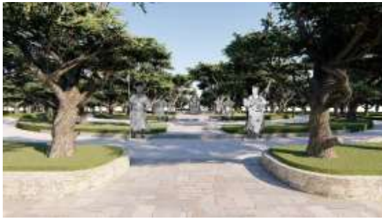
Figure 13 Burial Area Statues, 2021

The afterlife status figures located around the burial area consist of Yan Luo Wang 閻羅王-The Afterlife Judge, Pan Guan-Yang, Luo Wang's assistant and prosecutor, Hei Bai Wu Chang 黑白無常-Spirit Escorter afterlife guard, Niu Tou Ma Mian 牛頭馬面-Grim Reapers and Meng Po 孟婆-Afterlife Tea Maker. Each of these statues is placed at every entrance, and it is built in the center of the burial area where the larger one of Yan Luo Wang statue located. The placement of each statue is arranged based on the order in which the deceased will meet. Firstly, after the death, Nio Tou Ma Mian will come and will escort to the afterlife to meet Hei Bai Wu Chang before meeting Yang Luo Wang and his Pan Guans.