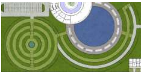
Figure 14 Burial Area, 2021

The afterlife status figures located around the burial area consist of Yan Luo Wang 閻羅王-The Afterlife Judge, Pan Guan-Yang, Luo Wang's assistant and prosecutor, Hei Bai Wu Chang 黑白無常-Spirit Escorter afterlife guard, Niu Tou Ma Mian 牛頭馬面-Grim Reapers and Meng Po 孟婆-Afterlife Tea Maker. Each of these statues is placed at every entrance, and it is built in the center of the burial area where the larger one of Yan Luo Wang statue located. The placement of each statue is arranged based on the order in which the deceased will meet. Firstly, after the death, Nio Tou Ma Mian will come and will escort to the afterlife to meet Hei Bai Wu Chang before meeting Yang Luo Wang and his Pan Guans.