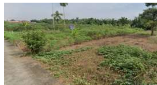
Figure 1 Location, 2021 ( 3^{\circ}30'02.8''N 98^{\circ}39'12.6''E )

Karunia Memorial Park and Crematorium is located at Jalan Bunga