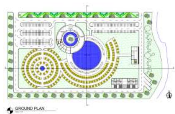
Figure 4 Ground Plan, 2021

Not only the location and the building mass that are influenced by the feng shui but also the materials used in the building have resembled feng shui five elements: water, wood, fire, soil, and metal. These elements are used in feng shui practice and are known as the basic elements that form the universe. It is believed that if these five elements reach their balance, they will establish harmony.