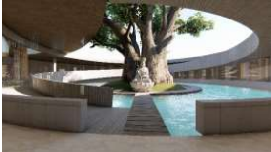
Figure 5 Courtyard, 2021

charge of the afterlife under a Bodhi Tree. Along the round pond, a circular ramp was designed to symbolize the journey to the afterlife.