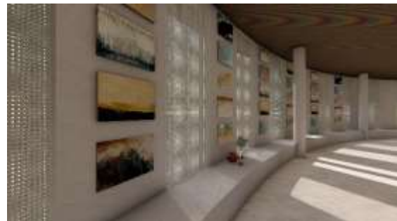
Figure 14 Columbarium, 2021

and wood. The three materials are commonly used in contemporary design to create a heavenly and peaceful ambiance. For the columbarium, where the transparent plastic webbing replaced some walls, natural light that enters the building throughout the webbing holes creates a beautiful atmosphere combined with the marble flooring.