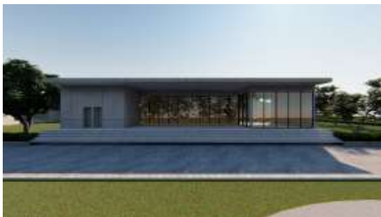
Figure 10 Common Building Facade, 2021