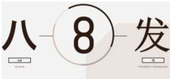
Figure 2 Homophone, 2021