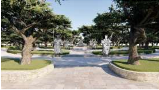
Figure 13 Burial Area Statues, 2021

The afterlife status figures located around the burial area consist of Yan Luo Wang 閻羅王-The Afterlife Judge, Pan Guan-Yang, Luo Wang's assistant and prosecutor, Hei Bai Wu Chang 黑白無常-Spirit Escorter afterlife guard, Niu Tou Ma Mian 牛頭馬面-Grim Reapers and Meng Po 孟婆-Afterlife Tea Maker. Each of these statues is placed at every entrance, and it is built in the center of the burial area where the larger one of Yan Luo Wang statue located. The placement of each statue is arranged based on the order in which the deceased will meet. Firstly, after the death, Nio Tou Ma Mian will come and will escort to the afterlife to meet Hei Bai Wu Chang before meeting Yang Luo Wang and his Pan Guans.