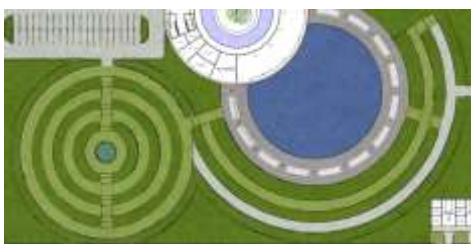
Figure 14 Burial Area, 2021

The afterlife status figures located around the burial area consist of Yan Luo Wang 閻羅王-The Afterlife Judge, Pan Guan-Yang, Luo Wang's assistant and prosecutor, Hei Bai Wu Chang 黑白無常-Spirit Escorter afterlife guard, Niu Tou Ma Mian 牛頭馬面-Grim Reapers and Meng Po 孟婆-Afterlife Tea Maker. Each of these statues is placed at every entrance, and it is built in the center of the burial area where the larger one of Yan Luo Wang statue located. The placement of each statue is arranged based on the order in which the deceased will meet. Firstly, after the death, Nio Tou Ma Mian will come and will escort to the afterlife to meet Hei Bai Wu Chang before meeting Yang Luo Wang and his Pan Guans.