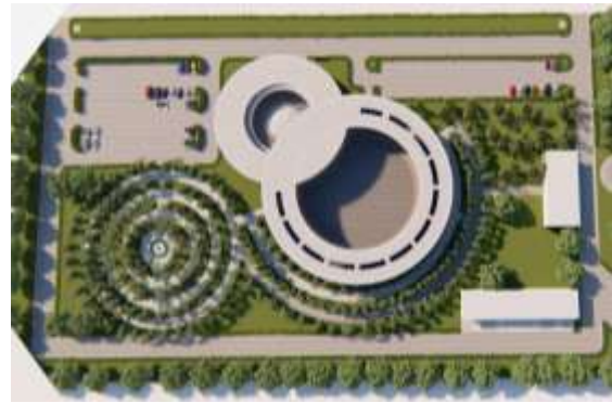
Figure 3 Site Plan, 2021