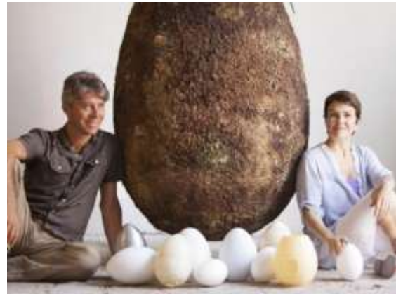
Figure 6 Capsula Mundi, 2020

Wood elements resemble the burial area and main building exterior. Karunia Memorial Park and Crematorium prohibit the procedure of conventional burial methods with coffins because it aims to be the first green burial in Indonesia. The usage of Capsula Mundi is to replace the coffin. Capsula Mundi is an egg-shaped pod made of biodegradable material [11]. Either the bodies or ashes is placed inside the pod for burial. The bodies are placed in the pod in a fetal position before the burial. The Capsula then will be buried as a seed on earth. A tree is chosen by the relatives, and the deceased will be planted on the top. It serves as a memorial for the departed as the legacy for posterity and the earth's future. Instead of the cold grey landscape nowadays, this practice will grow into a vibrant woodland or forest of memories.