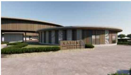
Figure 9 Main Building Facade, 2021