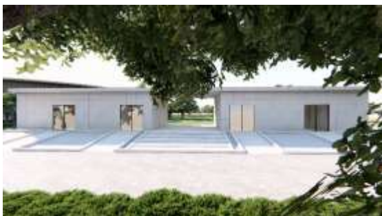
Figure 11 Cremation Building Facade, 2021

The fire element resembles the cremation oven. In conventional cremation,