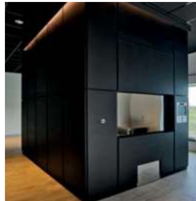
Figure 102 Electric Cremator, 2017

an oven where the main resource is gas or wood is very dangerous for the environment as it produces a lot of air pollution. Focusing on the environmentally friendly method, Karunia Memorial Park and Crematorium presents an eclectic-based cremation oven that does not produce any emissions into the air.