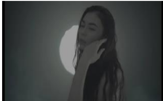
Figure 2. Hands Gesture and Body Language

According to Oxford Learner’s Dictionary, the gesture means a movement you make with your hands, head, or face to show a particular meaning. Jewitt, (2009, p. 14), Multimodality has been defined as "the approaches that understand communication and representation to be more than about language, and which attend to the full range of communicational forms people use—image, gesture, gaze, posture and so on—and the relationships between them."