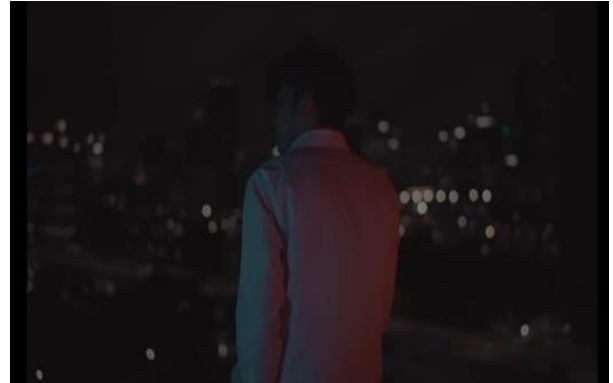
Figure 3. Categories of Visual Mode

This section is a comparative or descriptive analysis of the study based on the study results, previous literature, etc. The results should be offered in a logical sequence, given the most important finding first and addressing the stated objectives. The author should deal only with new or important aspects of the results obtained. The relevance of the findings in the context of existing literature or contemporary practice should be addressed. Most of the colors from the video clip image background are black. It took some places, but the visual color is black. It represent the sadness of romantic atmosphere for letting go the person he/she love.