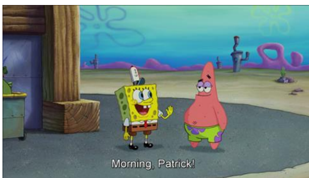
(Figure 4.1.19 Data Analysis at time 6:26)

From the following picture above found :