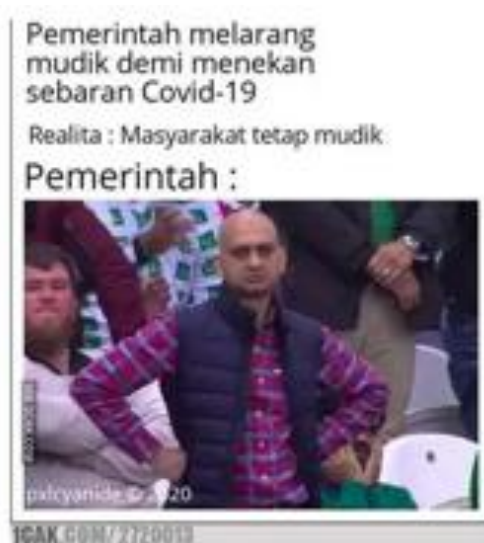
Figure 1. Prohibition on Returning to One's Home Area

The results obtained are based on data from memes about COVID-19 that the illocutionary expressive that appears is annoyance caused by various people's behaviors during the COVID-19 pandemic, such as people who are difficult to regulate, violate health protocols, and people's behavior is getting lazy. Another Illocutionary Expressive is showing condolences.