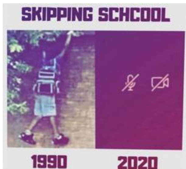
Figure 4. Skipping School

In this meme we can compare the reality that in ancient times or before COVID-19 existed when students skipped school they ran away from school, but nowadays with COVID-19 and school is done virtually via zoom, students who skip school only just turn off the mic and camera [7][8]. It includes a disappointed expression.