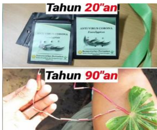
Figure 7. Necklace

The meme explained that before 2020 and before COVID-19 attacks the world, most people certainly already have plans and dreams for the future. But in the future, it turns out that everything is hampered by the COVID-19 virus. It includes a disappointed expression.