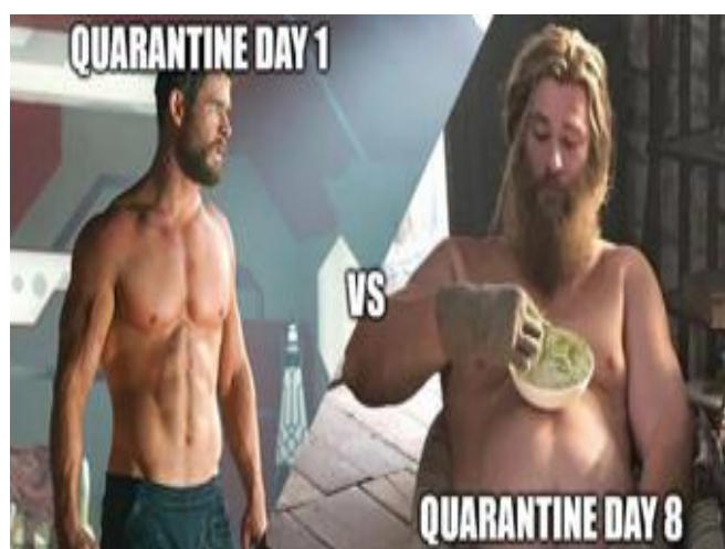
Figure 5. Quarantine

In this meme we can compare the reality that in ancient times or before COVID-19 existed when students skipped school they ran away from school, but nowadays with COVID-19 and school is done virtually via zoom, students who skip school only just turn off the mic and camera [7][8]. It includes a disappointed expression.