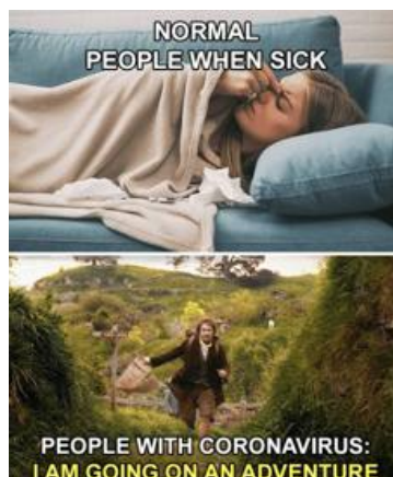
Figur 7. Isolation

In the meme, it is seen that before the COVID-19 virus there were many creative children who made crafts from natural materials, for example, cassava leaves in the photo. But nowadays, since the pandemic, people are competing to wear anti-virus necklaces [10]. It includes a disappointed expression.