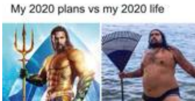
Figure 6. Plans

The meme explained that before 2020 and before COVID-19 attacks the world, most people certainly already have plans and dreams for the future. But in the future, it turns out that everything is hampered by the COVID-19 virus. It includes a disappointed expression.