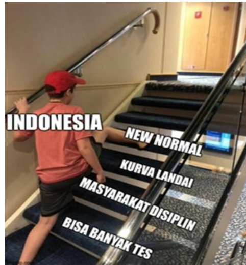
Figur 8. Duty

In this meme, it can be explained that when normal people who are sick they can rest at home until they recover, but when someone is exposed to the corona virus, he must self-isolate in a hospital or in a safe place by staying alone until he recovers. It includes a disappointed expression.