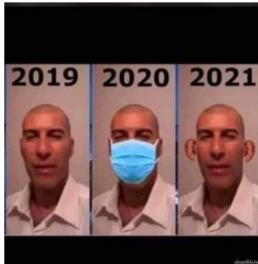
Figure 2. Masker

In the meme appears that our situation has been from year to year before the arrival of the COVID-19 virus. In 2019 when things were still normal we didn't need to wear masks, in 2020 when the pandemic came we had to wear masks whenever and wherever, then by 2021 the pandemic was still continuing, most people increasingly disobeyed health protocols, just listening [5]. It includes a disappointed expression.