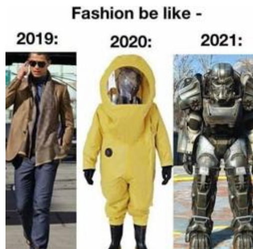
Figure 3. Fashion

In the meme appears that our situation has been from year to year before the arrival of the COVID-19 virus. In 2019 when things were still normal we didn't need to wear masks, in 2020 when the pandemic came we had to wear masks whenever and wherever, then by 2021 the pandemic was still continuing, most people increasingly disobeyed health protocols, just listening [5]. It includes a disappointed expression.