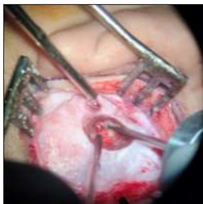
Figure 3. Drilling the Atretic Bone to External Ear Canal

We drilled the atretic bones and removed it for the external canal and we found ossicular chain and normal (figure 3). The facial nerves were exposed. Graft from musculus temporalis was placed over the mobilized ossicular chain. To made epithelization of the new tympanic membrane we covering the fascia graft with skin graft (pedicle flap) and compressed with gelfoam (figure 5).