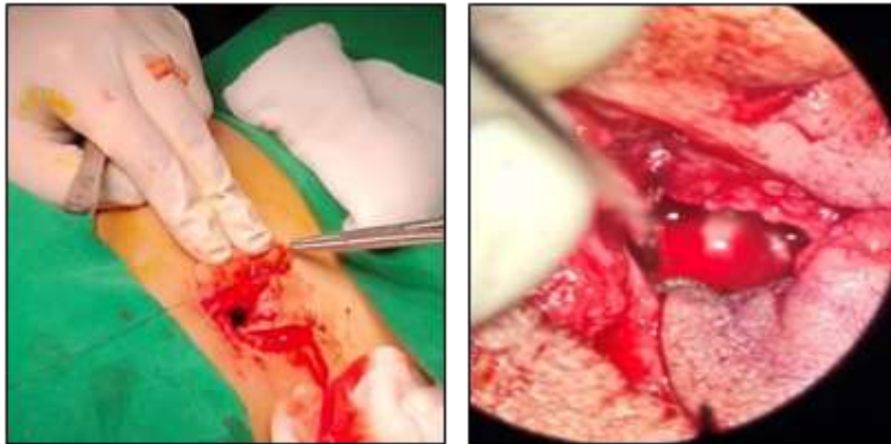
Figure 4. Covering the Fascia Graft with Skin Graft

After surgery, the patient was given IVFD RL, antibiotic, steroid, analgetic and antihemorrhagic administered intravenously. We found a facial palsy one day after surgery with House-Brackmann II and we consult to the physiotherapy (figure 5).