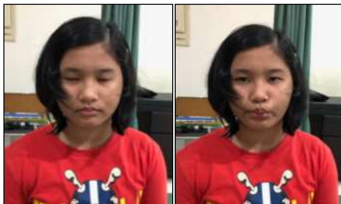
Figure 6. Facial Palsy did not Found Anymore

One month after surgery the patient got better. The facial palsy did not found anymore, she can smile and close her eyes perfectly (figure 6). Wound of the operation was dry, headache and dizziness did not found.